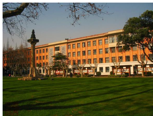
North Building for parallel sessions