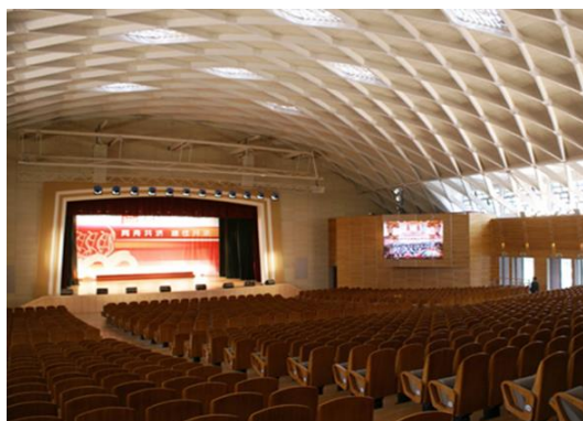
Tongji University Auditorium