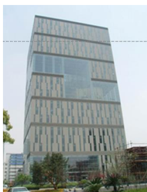
Zhonghe Building: parallel sessions, registration, posters and exhibition