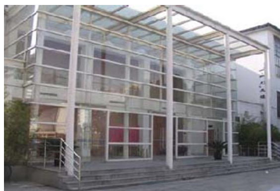
129 Hall: Closing Ceremony